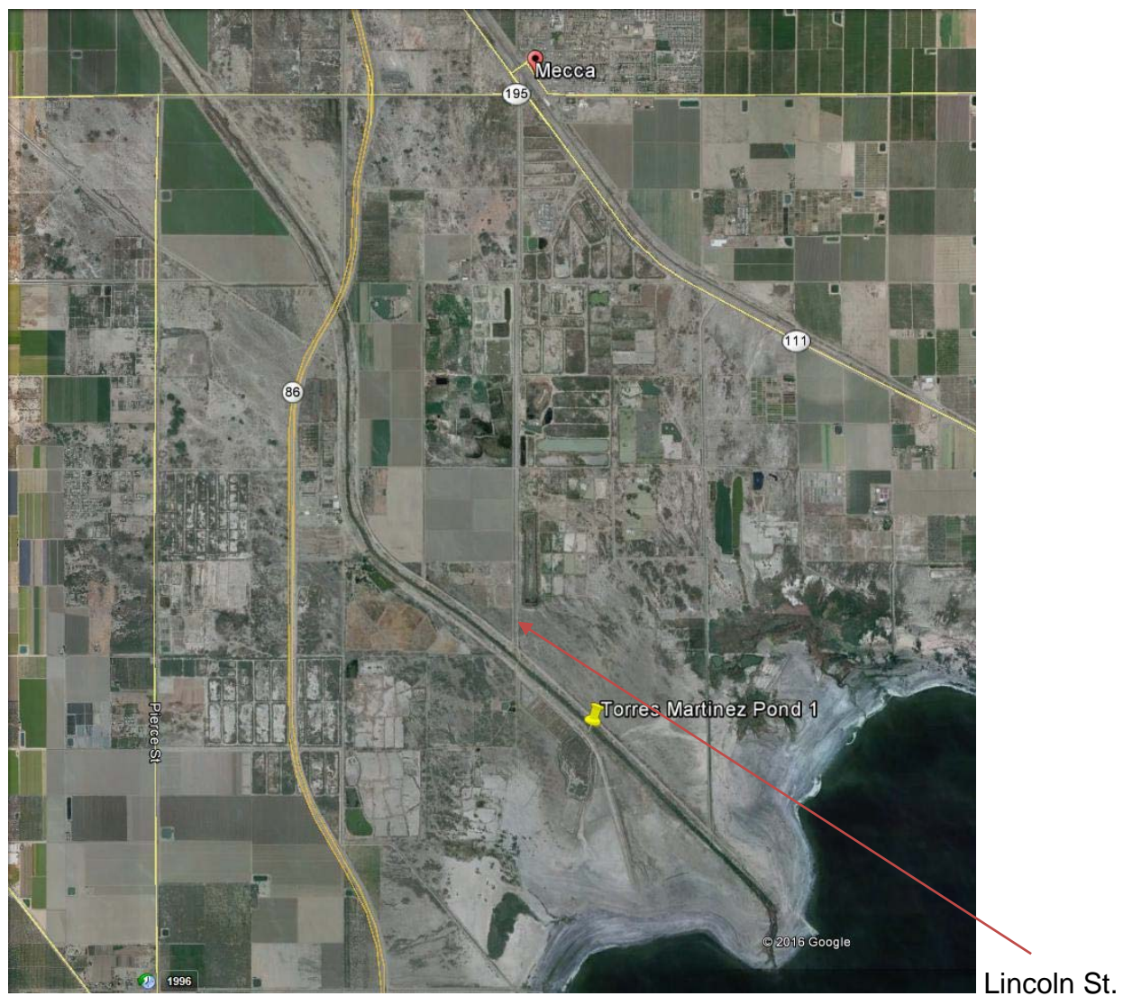
Location of project at south end of Lincoln Street, Mecca, CA