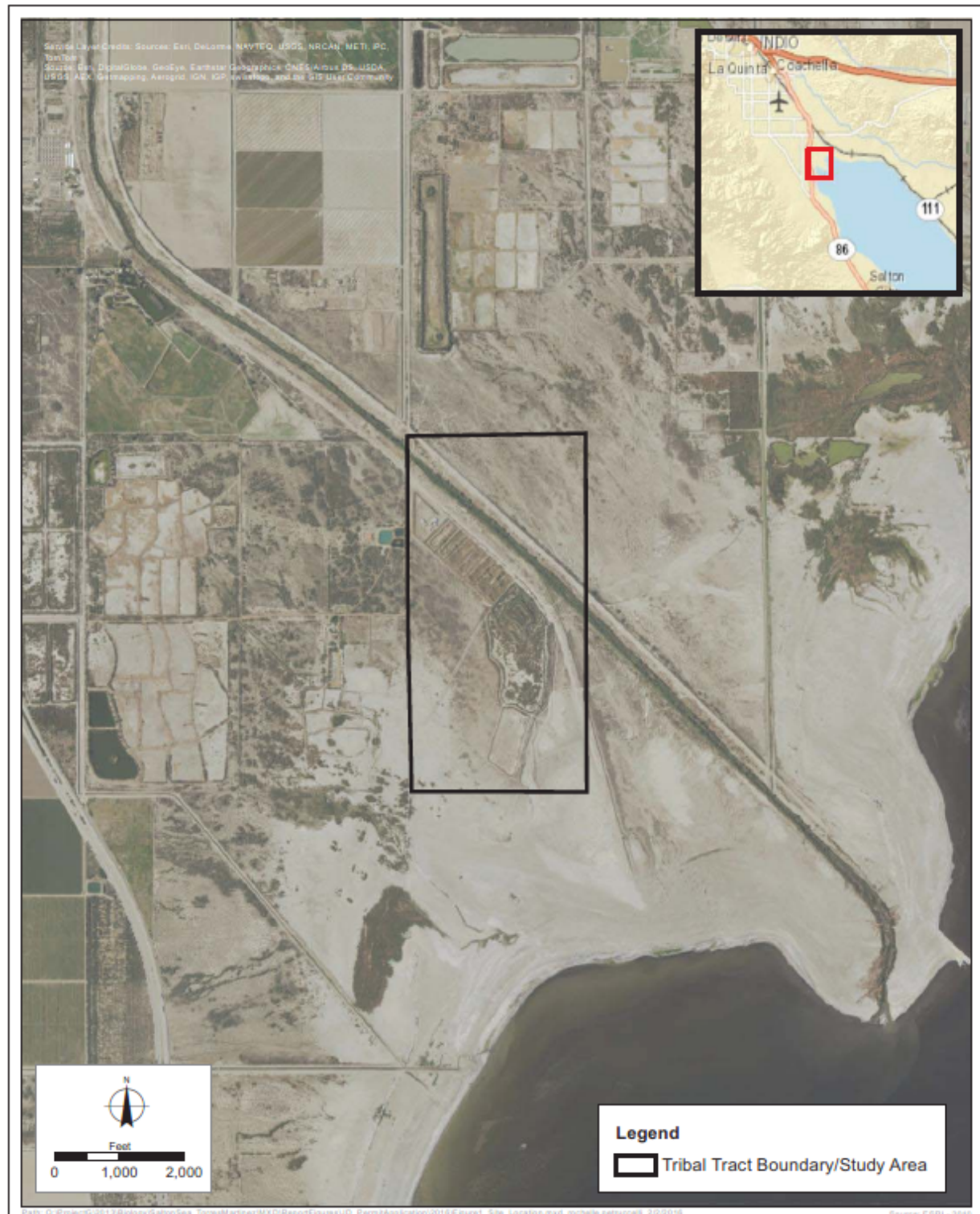
Regional Location Habitat Enhancement at the Torres Martinez Wetlands Salton Sea Authority